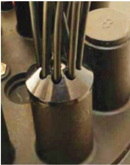
Drop cable sealing